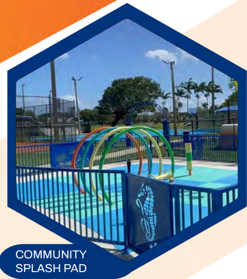
COMMUNITY SPLASH PAD