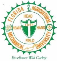
EXHIBIT A MANAGEMENT'S RESPONSE

DEVELOPMENTAL RESEARCH SCHOOL 400 W. ORANGE AVENUE