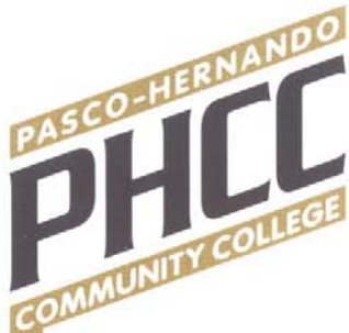
EXHIBIT B MANAGEMENT RESPONSES (CONTINUED)