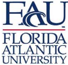
EXHIBIT A MANAGEMENT’S RESPONSE