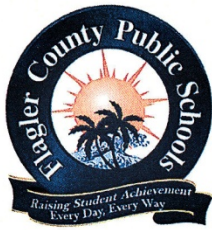
EXHIBIT – A MANAGEMENT’S RESPONSE