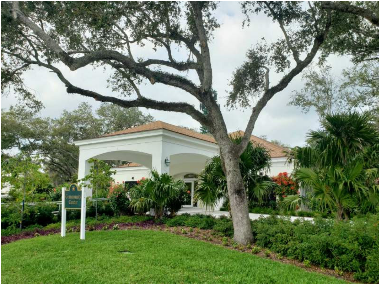
The Town of Indian River Shores Community Center