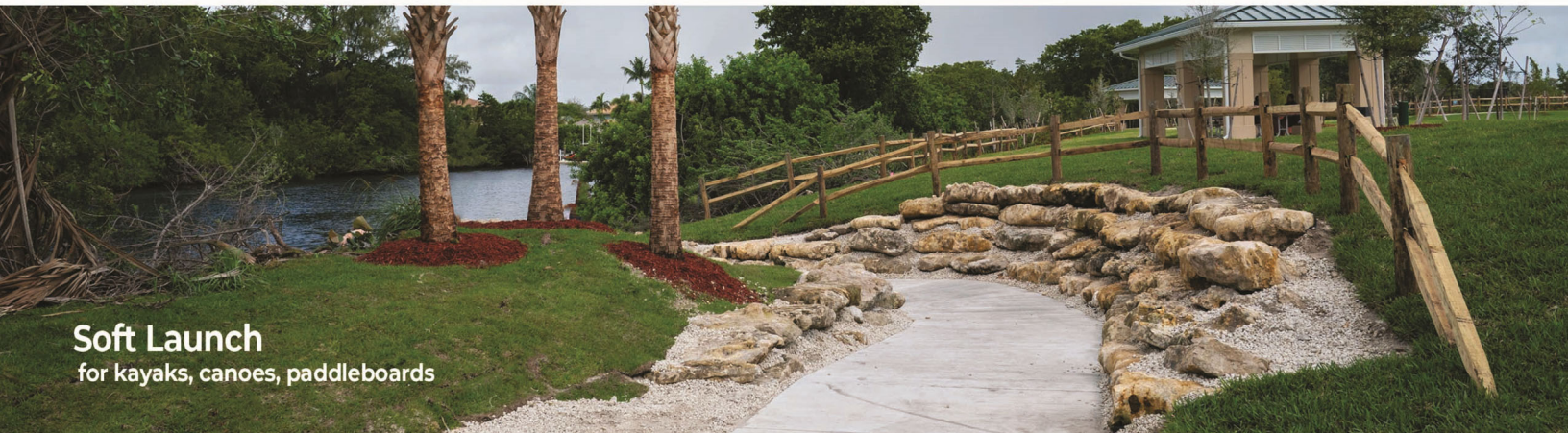
Soft Launch for kayaks, canoes, paddleboards